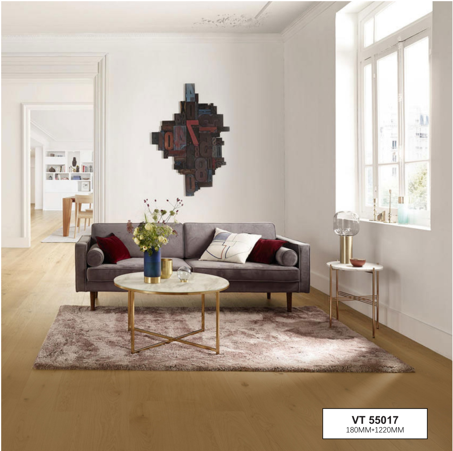
VT 55017 180MM*1220MM